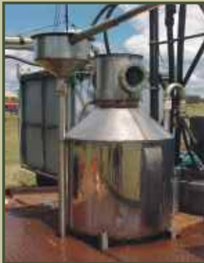
The Lemon Myrtle Distillery

Further research at Charles Sturt University found that Lemon Myrtle ( Backhousia citriodora ) has very good anti-bacterial and anti-fungal activity. In fact, studies suggest that Backhousia oil has better anti-bacterial and anti-fungal properties than the better known Tea Tree ( Melaleuca alternifolia ).