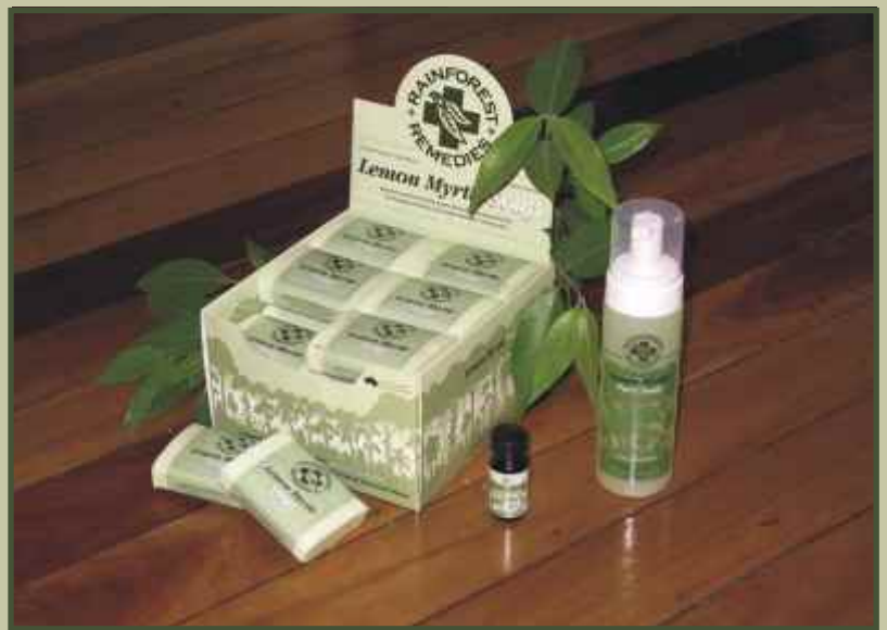
Rainforest Remedies Lemon Myrtle Products

Lemon Myrtle is a rainforest plant grown organically on Sub-Tropical plantations on the Northern Coast of New South Wales